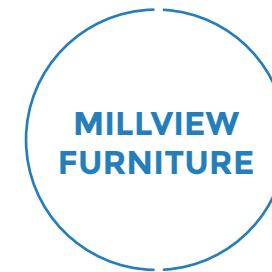
Millview Furniture Bagenalstown Manufacturer of Bespoke furniture in Solid wood - veneers - solid surfaces