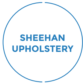
Sheehan Upholstery Athlunkard Larkins Cross Co. Limerick City of Limerick